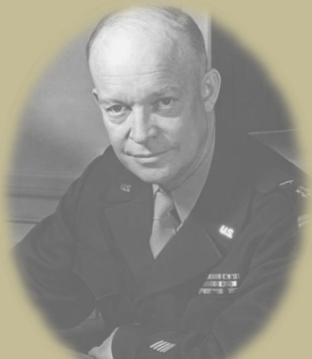
General Dwight D. Eisenhower

“The things I saw beggar description... The visual evidence and the verbal testimony of starvation, cruelty, and bestiality were so overpowering.”